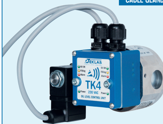
TWO MOUNTING POSSIBILITIES WITH THE SAME PRODUCT (LEFT/RIGHT)