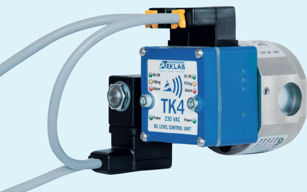
TWO MOUNTING POSSIBILITIES WITH THE SAME PRODUCT (LEFT/RIGHT)