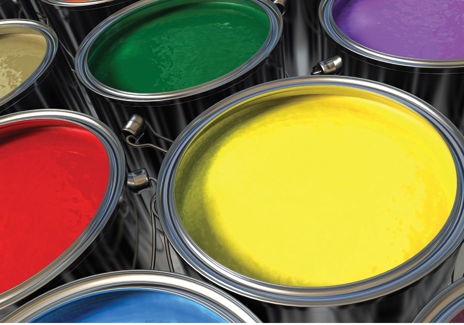
Tuthill L & C Series pumps continue to be an integral part of producing countless perfect shades of paint.