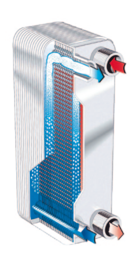
Evaporator, showing flow principle.

In the illustration of a condenser the light and dark blue arrows show the location of the brine connections. The refrigerant flows counter current in the opposite channel and is cooled. The light and dark red arrows indicate the locations of the refrigerant connections.