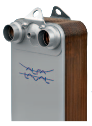
◆AC500DQ with a double refrigerant circuit unit. It is suitable to work as an evaporator and a condenser.