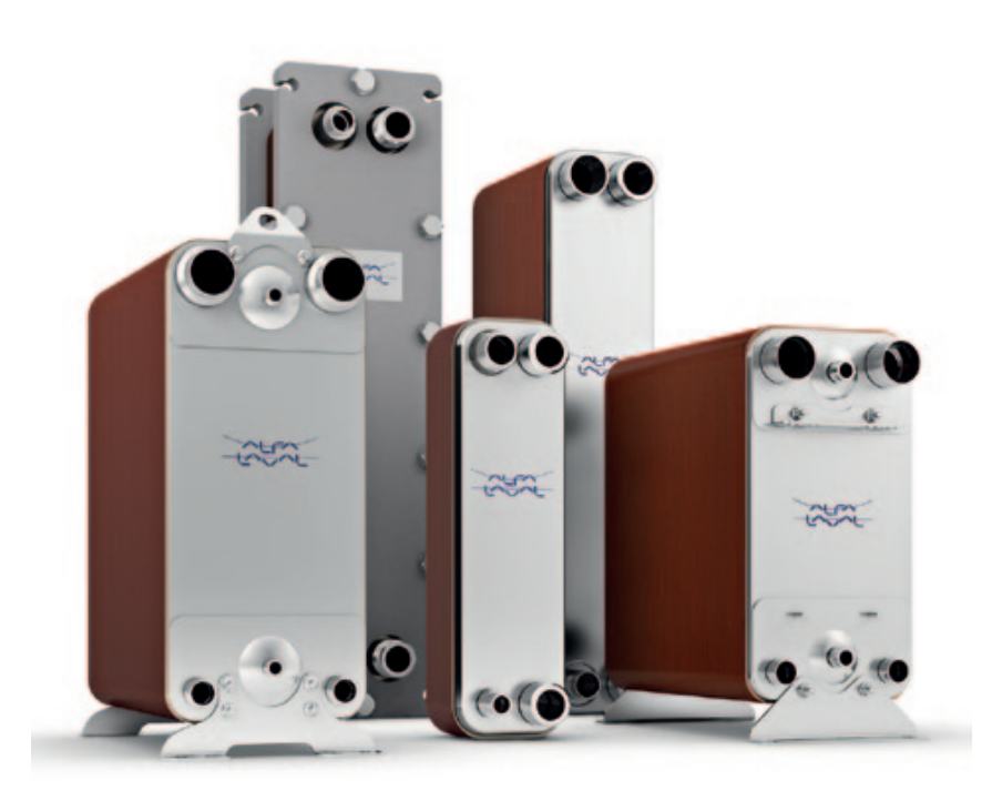
There's an Alfa Laval brazed plate heat exchanger for every duty! Alfa Laval BHEs are available in a broad range of capacities and dimensions.

The Alfa Laval brazed plate heat exchanger (BHE) concept is a variation on the traditional plate and frame heat exchanger, but without gaskets and frame parts. Developed in the seventies, today Alfa Laval BHEs are well-established components in refrigeration plants due to their compact, durable designs, ease of installation and cost efficient operation.