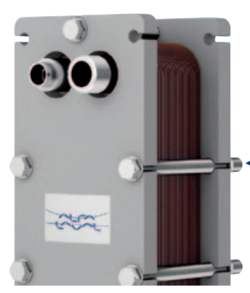
◆AXP52 is a brazed plate heat exchanger with thin external frames that withstands operating pressures of 130 bar. AXP52 is specially designed to fulfill the need when using CO₂ as refrigerant in subcritical and transcritical applications.