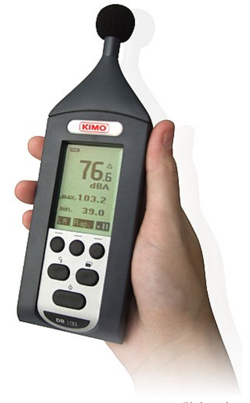
*Livré avec écran anti-vent

DO NOT PLUG USB cable. The output is not USB compatible, the plug is maintenance- and optional accessory-specific.